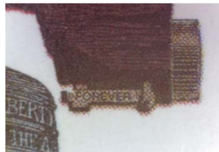
Liberty Bell Microprinting

(Ashton-Potter Printing, Pressure Sensitive Adhesive)